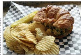
A baked chicken salad sandwich at Tazas Coffee includes rice and chopped walnuts.

When it comes to food, we here in the Schertz area have a lot of options. From the local food trucks to the many restaurants in the area, there's always something to eat. One of the newest additions to the area is Tazas Coffee, a new cafe and coffee shop located in Universal City. Tazas Coffee is a great place to grab a quick bite or a full meal. The menu is diverse and includes a variety of options for everyone. From coffee and pastries to sandwiches and salads, there's something for everyone. The staff is friendly and the atmosphere is warm and inviting. Tazas Coffee is a great addition to the area and we're excited to see it succeed.