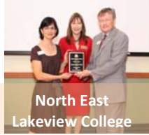
North East Lakeview College