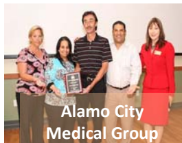
Alamo City Medical Group

We are excited to have you in our Chamber!